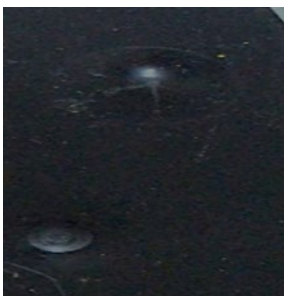
Figure1. Aluminum surface impact test

TaberWear Index = \frac{(F_{total} \times T)}{n} F_{total} = A_{first} - B_{End} n= cycle T = mass loss at an average of 1000 cycle