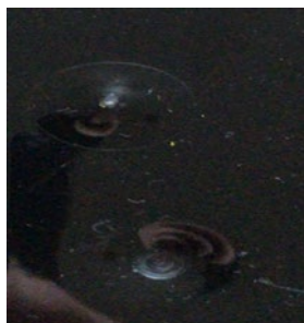
Figure 2. Galvanized surface impact test