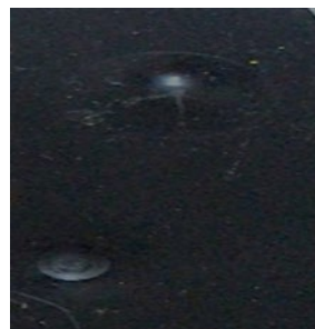
Figure 3. Sheet metal impact test