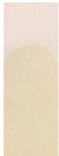
Figure 7. Yellowing resistance

Note: Experiments were carried out under Izel Kimya laboratory conditions aimed to give information about the product features. Results may vary according to the user and application condition.