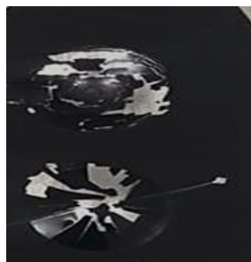
Figure 2. Galvanized surface impact test