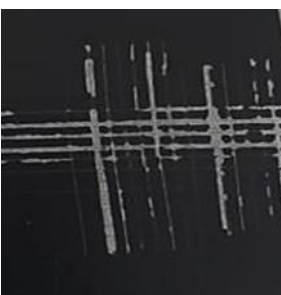
Figure 4. Aluminum surface adhesion test