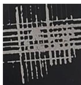
Figure 6. Sheet metal surface adhesion test