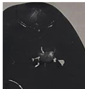
Figure 3. Sheet metal impact test