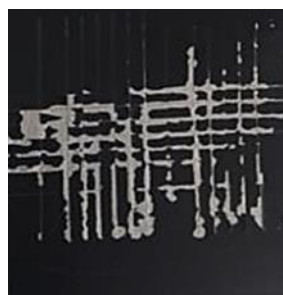
Figure 5. Galvanized surface adhesion test