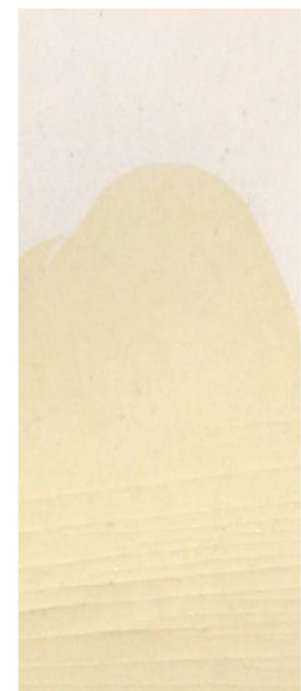
Figure 7. Yellowing resistance

Note: Experiments were carried out under Izel Kimya laboratory conditions aimed to give information about the product features. Results may vary according to the user and application condition