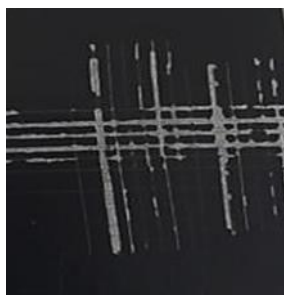
Figure 4. Aluminum surface adhesion test