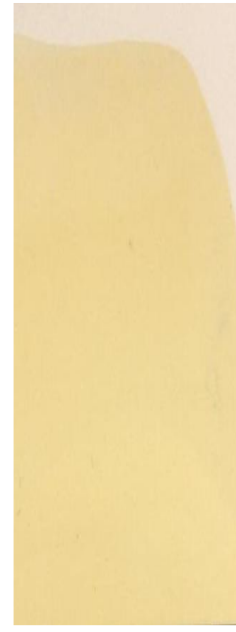
Figure 7. Yellowing resistance

Note: Experiments were carried out under Izel Kimya laboratory conditions aimed to give information about the product features. Results may vary according to the user and application condition.