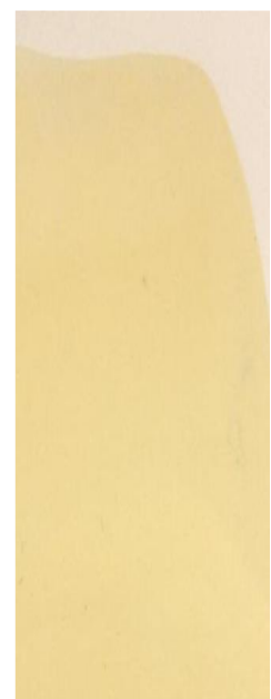
Figure 7. Yellowing resistance

Note: Experiments were carried out under Izel Kimya laboratory conditions aimed to give information about the product features. Results may vary according to the user and application condition.