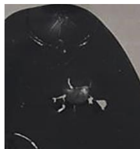
Figure 3. Sheet metal impact test