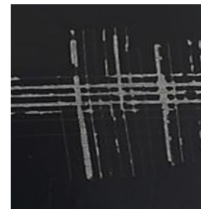
Figure 6. Sheet metal surface adhesion test