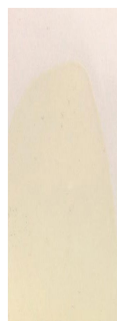
Figure 7. Yellowing resistance

Note: Experiments were carried out under Izel Kimya laboratory conditions aimed to give information about the product features. Results may vary according to the user and application condition