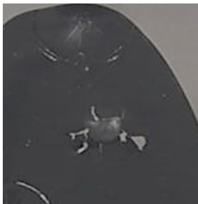
Figure 1. Aluminum surface impact test

TaberWear Index = (F_{total} \times T) / n F_{total} = A_{first} - B_{End} n= cycle T = mass loss at an average of 1000 cycle