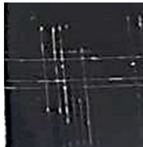
Figure 5. Galvanized surface adhesion test