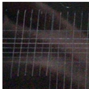
Figure 4. Aluminum surface adhesion test